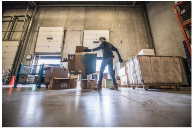
A WINS staff member prepares to break down boxes in the WINS Donation Centre after assisting with a donation drop off.